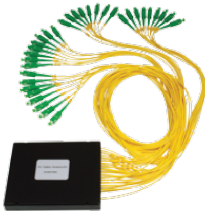
PLC Splitter ABS Type